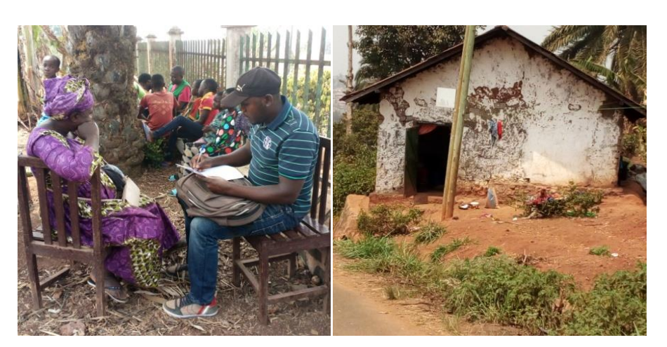
Picture 2: DEH Data analyst/ research coordinator collecting data from a sampled IDP in the West Region of Cameroon