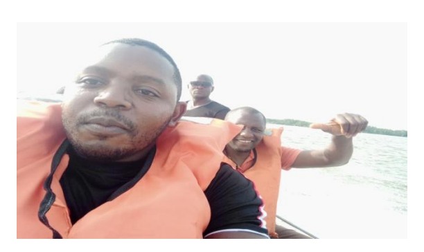
Picture 3: DEH Data Analyst/Research Coordinator and Environment/Climate Change Expert on their way for data collection in Camp Cameroon and Manoka, Douala city, Cameroon

1.5. DEH also collected and analyzed data on the sources and effects of sea pollution on fishing at the Douala 6 municipality